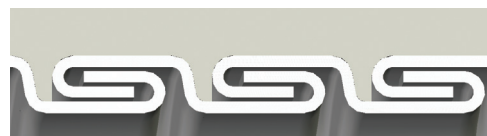
Interlocked Design 1-1/2" through 4" with no bonding wire