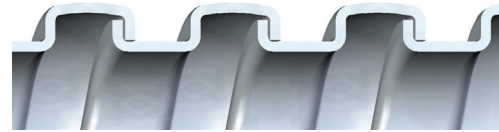
Square Lock Construction