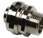
Straight Fitting NPT Thread 3/8" through 2"