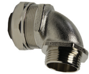
90° Fitting NPT Thread 3/8" through 2"